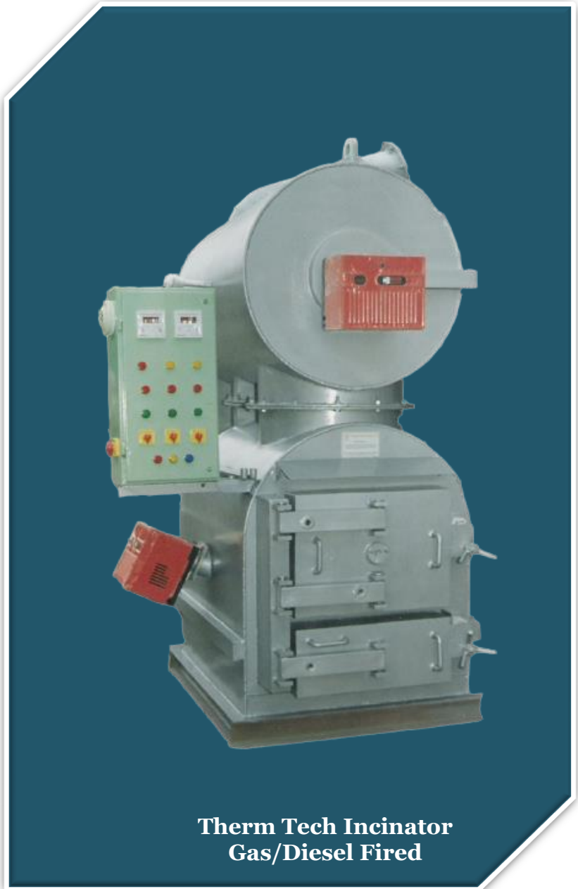
Therm Tech Incinerator Gas/Diesel Fired

Therm-Tech Incinerator is a package type, all weather type and mounted on base frame for easy transportation. Incineration is batch type and waste feeding is manual. The Incinerator has 2 chambers, primary chamber and secondary chamber. Both the primary and secondary chambers are provided with pressure jet burners for incineration of bio-medical waste. For general waste burner is provided only in primary chamber. The primary chamber is provided with air pressure nozzles. Cyclone separator & Forced draft fan are provided and mounted on the base frame of the Incinerator to ensure that no ash particles are let out of the exhaust. The quality of incineration achieved is excellent. A dust proof pre-wired control panel housing all safeties, temperature controllers for primary chamber, secondary chamber and flue gas temperatures are provided. It also incorporates contactors, overload relays and MCBs for electricals. Alarm hooter is provided along with audiovisual alarms for abnormal working conditions. In case of defect in the process, the Incinerator comes to a stand still and the fault is indicated on the control panel. Suitable protection for burner is provided. Waste charging door and ash removal door is provided on the Incinerator. The Incinerator is refractory lined and does not require any civil works at site.